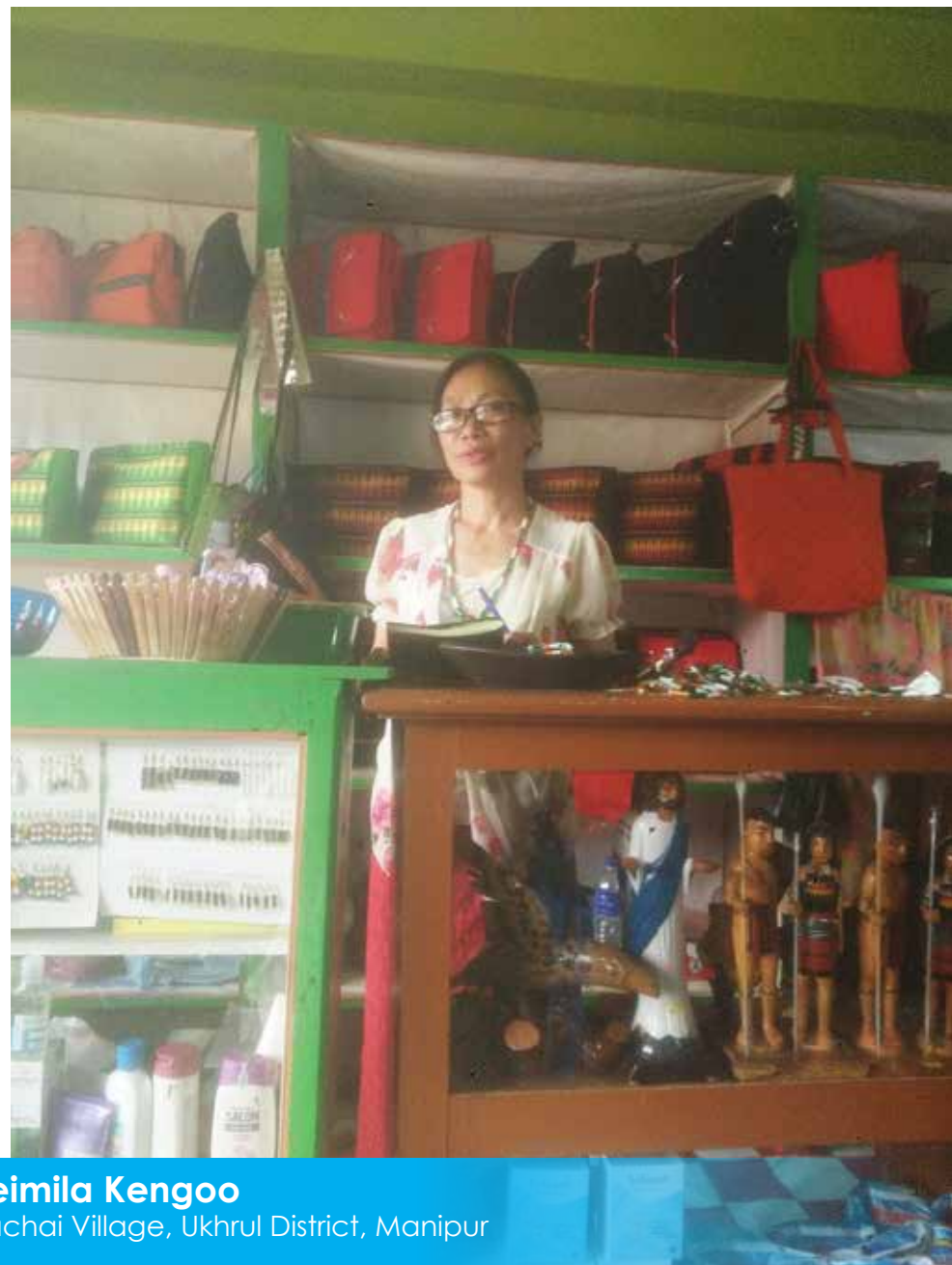
Peimila Kengoo Kachai Village, Ukhrul District, Manipur