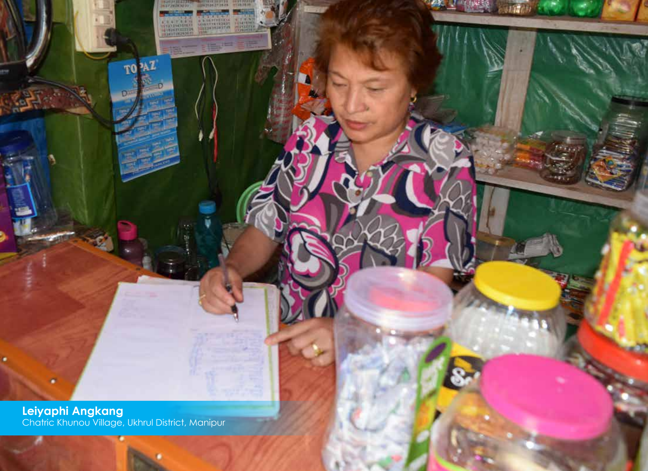
Leiyaphi Angkang Chatric Khunou Village, Ukhrul District, Manipur