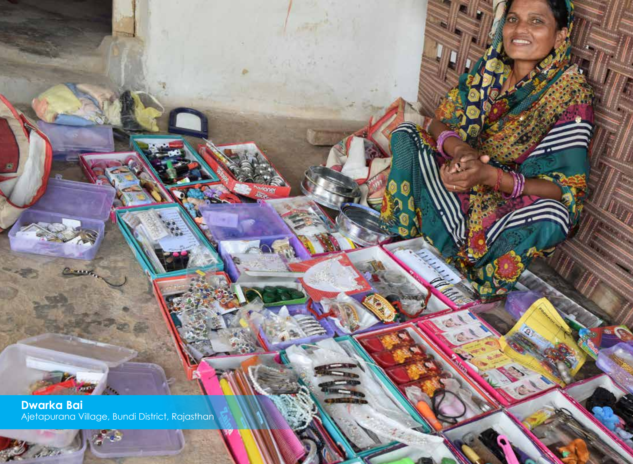
Dwarka Bai Ajetapurana Village, Bundi District, Rajasthan