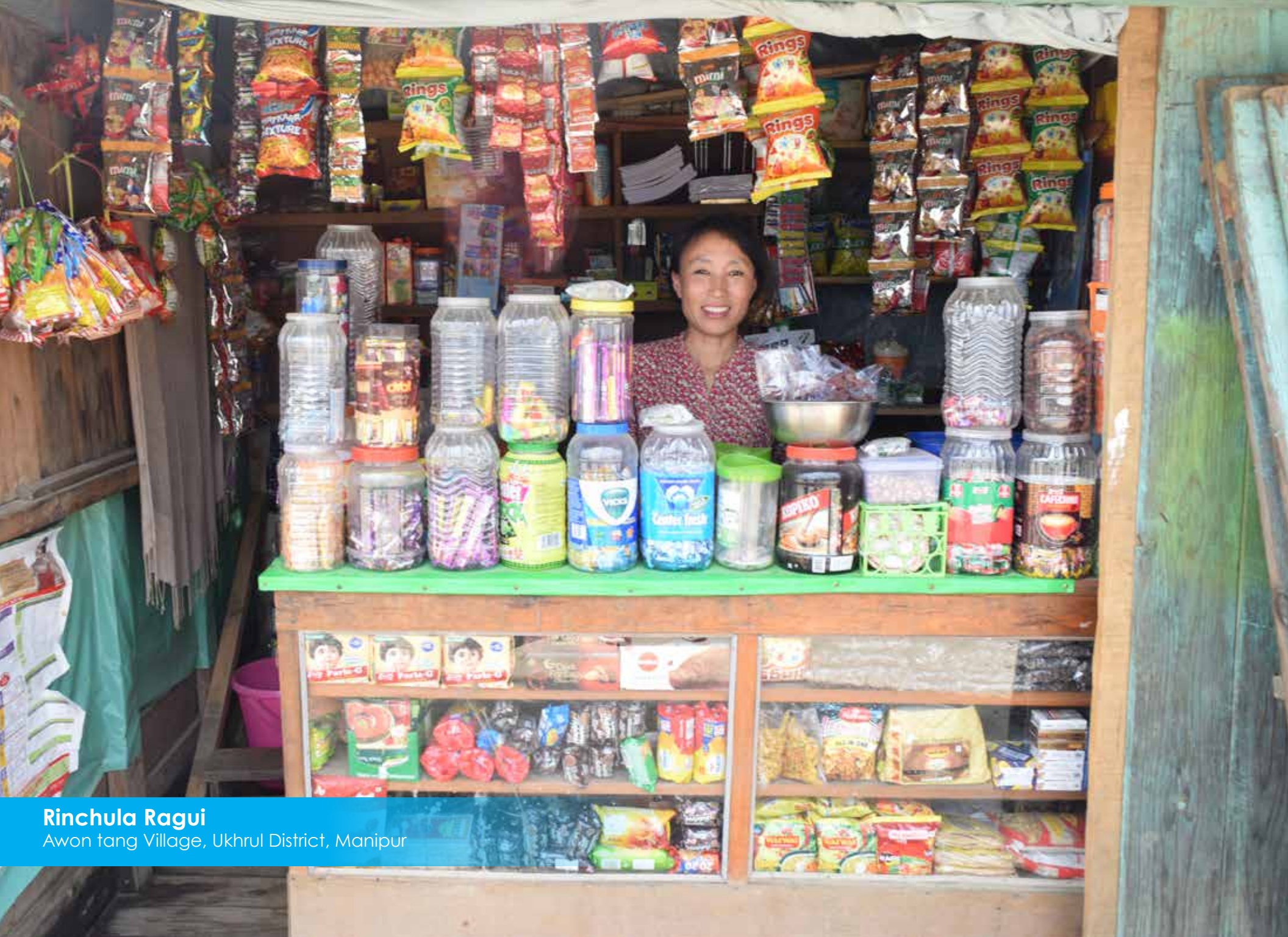
Rinchula Ragui Awon tang Village, Ukhrul District, Manipur